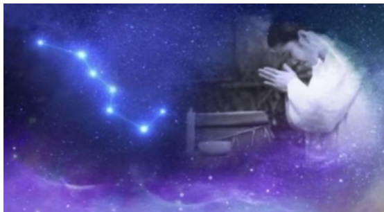
A Korean mother praying to the Seven Stars God while holding a bowl of clean water.

Korean mothers developed a custom of pouring clear well water into a bowl and praying for their families toward the Big Dipper (the seven stars of the Great Bear) at dawn.